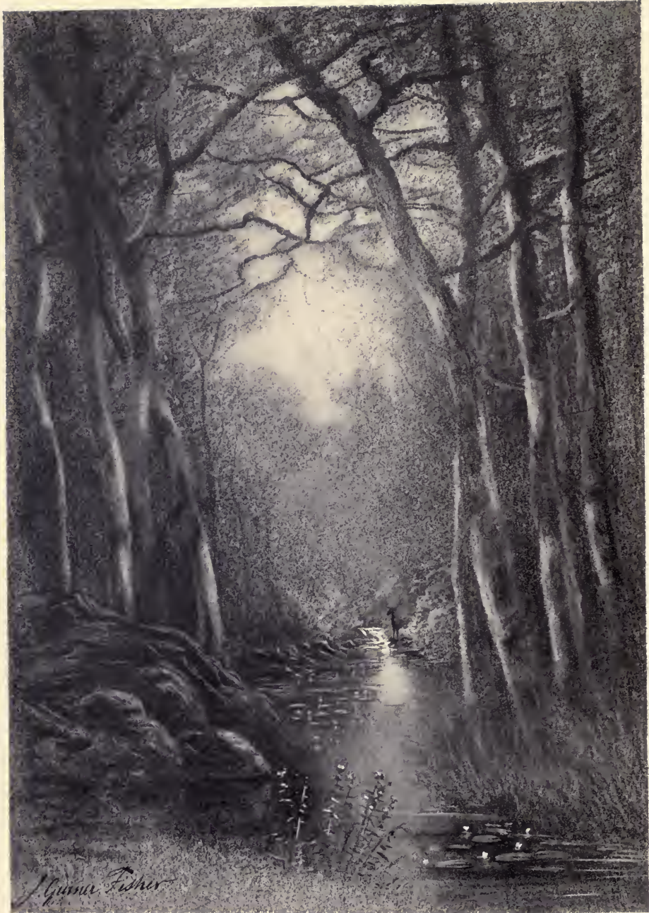
THE WILD DEER'S HOME.